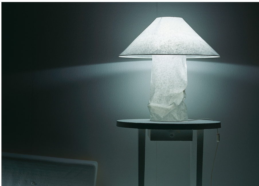
Lampampe INGO MAURER 1980

Japanese paper, metal. Lampampe is part of a series of simple lamps made of Japanese paper that Ingo Maurer developed in the late 1970s / early 1980s. In this design, he takes up the shape of traditional lampshades and yet formulates a new aesthetic. The shades are handmade in our production facility in Munich. The paper creates a soft, completely glare-free light. The paper is slightly creased as a deliberate design element.